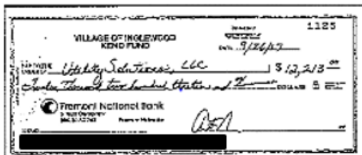
Check 1125, Amount $12,213.00 On 10/2/2017

The APA obtained the bank statements for the Village's accounts from its fiscal year 2018 audit waiver request. From these statements, the APA noted two Village checks, totaling $12,663.00, written during the examination period that contained only one signature. Examples of such checks are shown below: