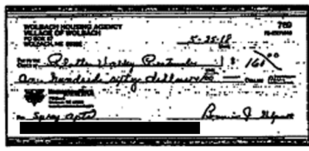
AM: 160.00 CK: 769 DT: 06/12 RF: 00003635 Paid

State statute requires Village checks to be signed by both the Village Board (Board) Chairperson and the Village Clerk. Specifically, Neb. Rev. Stat. § 17-711 (Cum. Supp. 2018) provides the following: