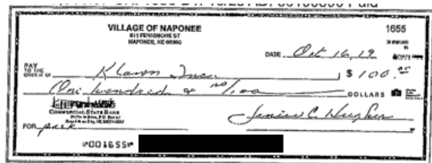
AM: 100.00 CK: 1655 DT: 10/31 AD: 80100400 Paid

State statute requires Village checks to be signed by both the Board Chairperson and the Village Clerk. Specifically, Neb. Rev. Stat. § 17-711 (Cum. Supp. 2020) provides the following: