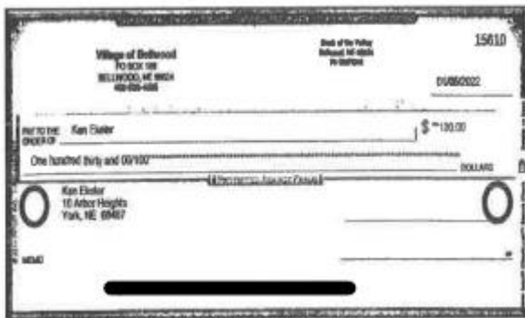
Check 15610 Amount $130.00 Date: 1/11/2022

The APA obtained the bank statements for the Village's accounts from its fiscal year 2022 audit waiver request. From these statements, the APA noted that two of the Village checks written during the examination period did not contain a signature. Copies of these checks are shown below.